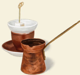
Turkish Coffee |H 8.2 boiled coffee · sweetened or unsweetened · Lokum