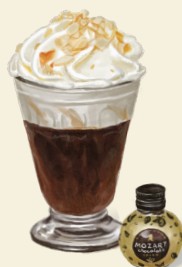
Mozart Coffee |G 11,- long espresso shot · mozart liqueur · whipped cream